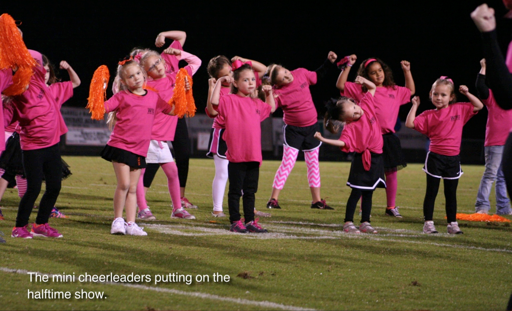
The mini cheerleaders putting on the halftime show.