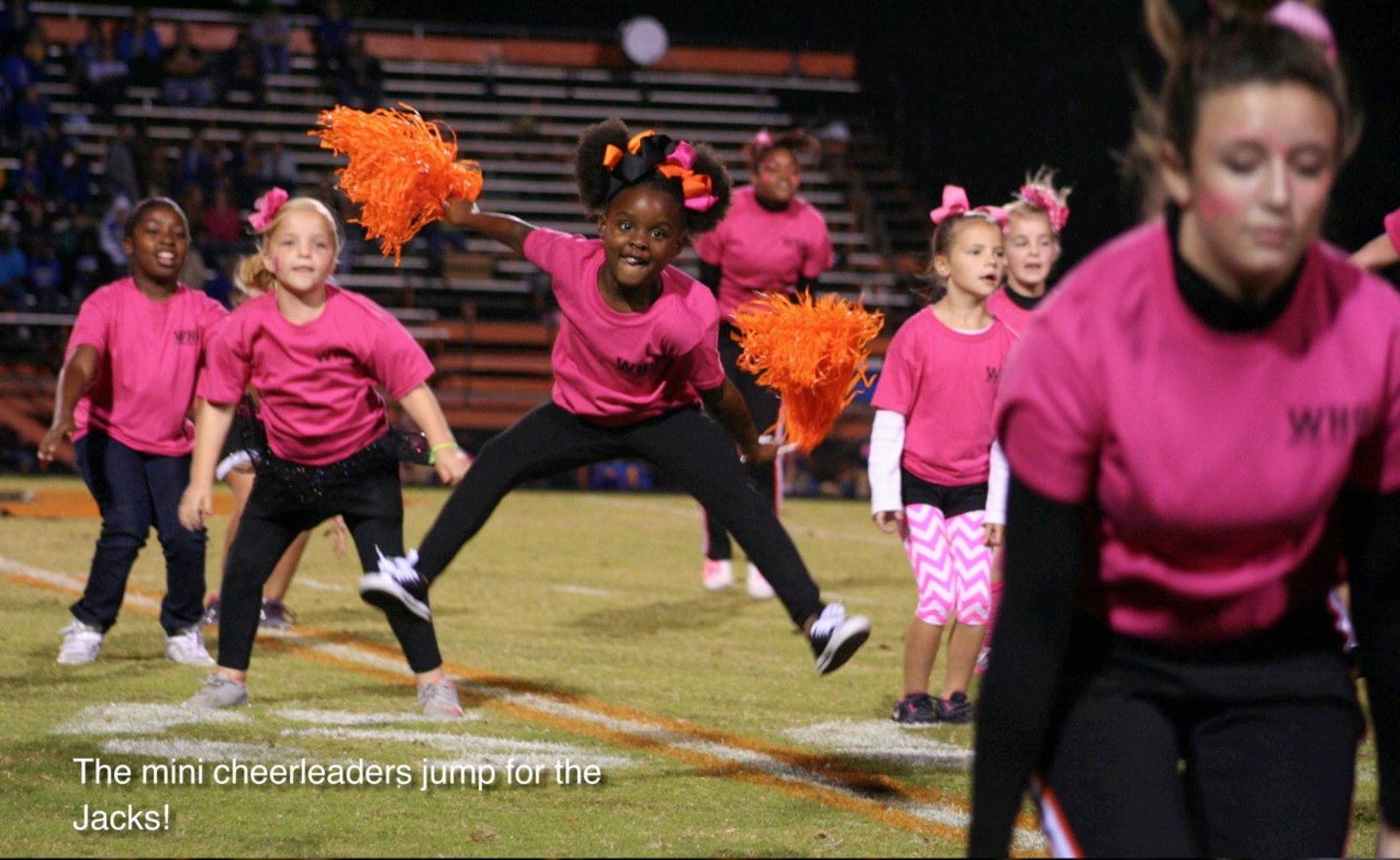
The mini cheerleaders jump for the Jacks!