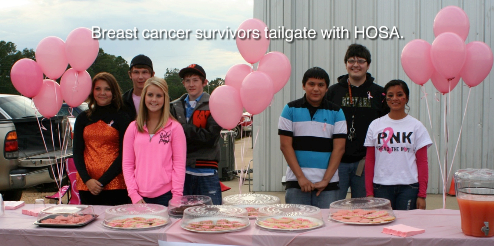
Breast cancer survivors tailgate with HOSA.