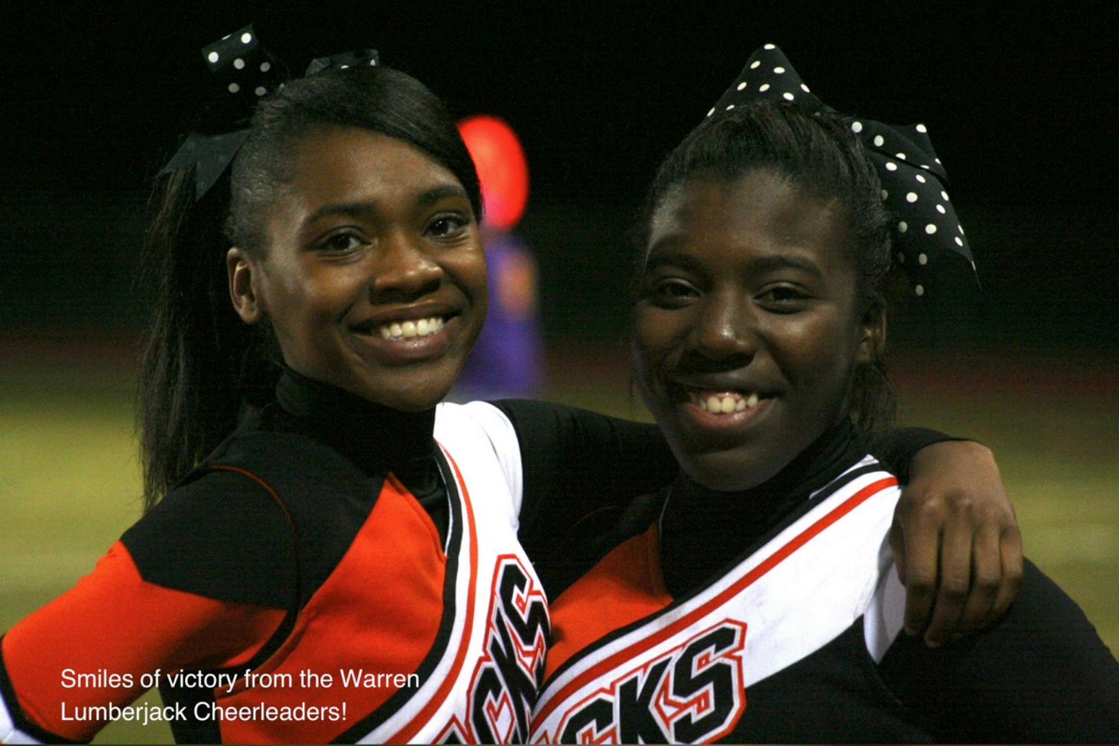
Smiles of victory from the Warren Lumberjack Cheerleaders!