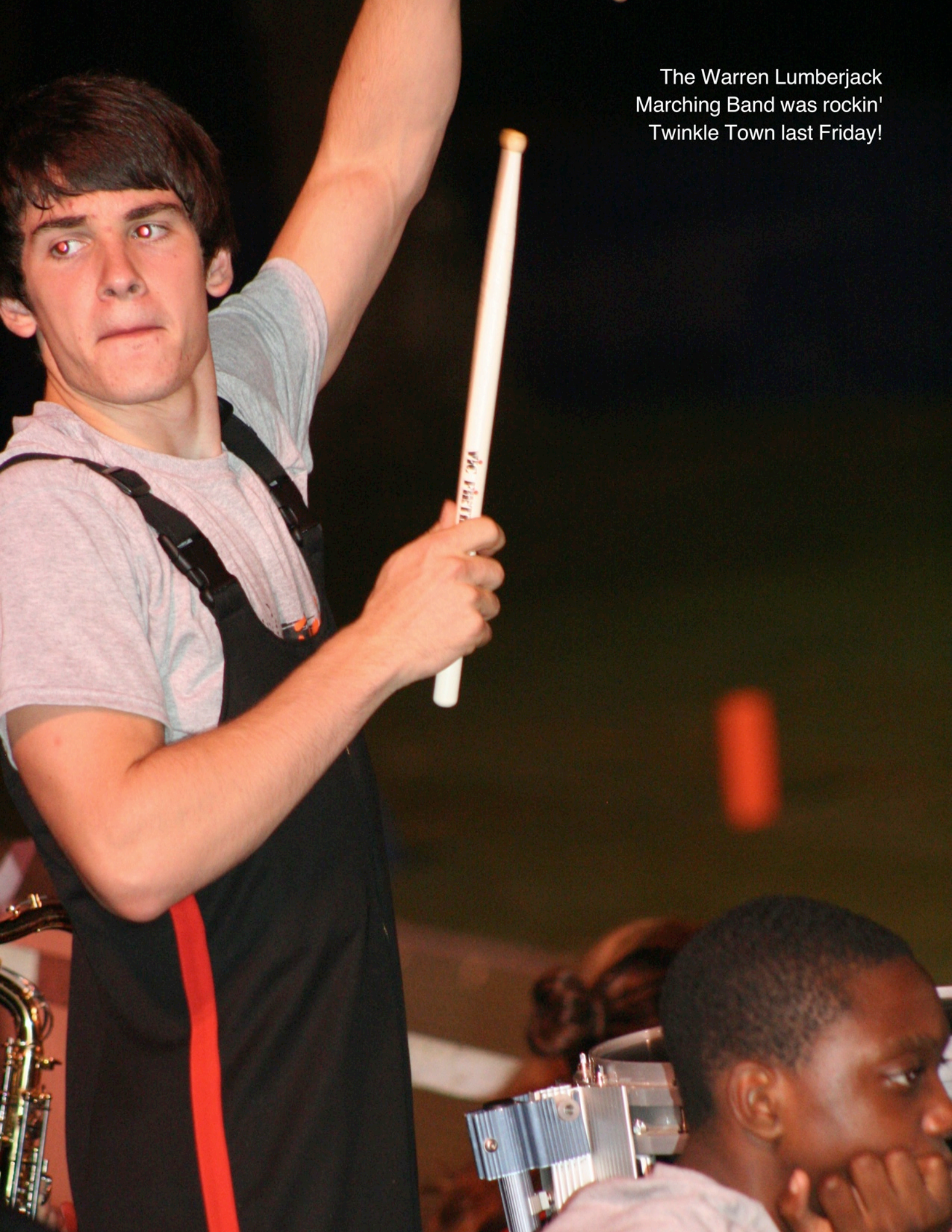
The Warren Lumberjack Marching Band was rockin' Twinkle Town last Friday!